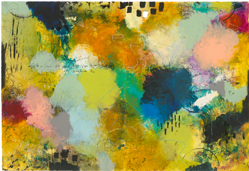
Working Theories 2018 acrylic & graphite, diptych image/sheet 31 x 45"