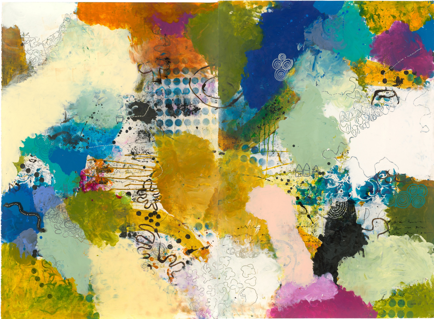
Affirmation 2018 acrylic & graphite, image/sheet 44 x 60"