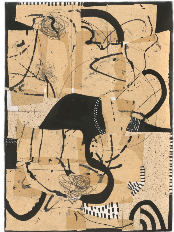
Frequency III 2019, collage with monotype & acrylic, image/sheet 30 7/8 x 22 3/8"