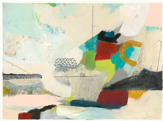
Go Slowly 2017 acrylic, collage & graphite, image/sheet 22 x 30"