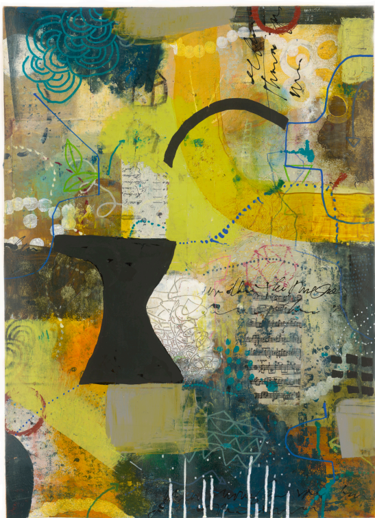
Time Stamp 2010-19 acrylic, graphite & collage image/sheet 30 x 22 1/2"