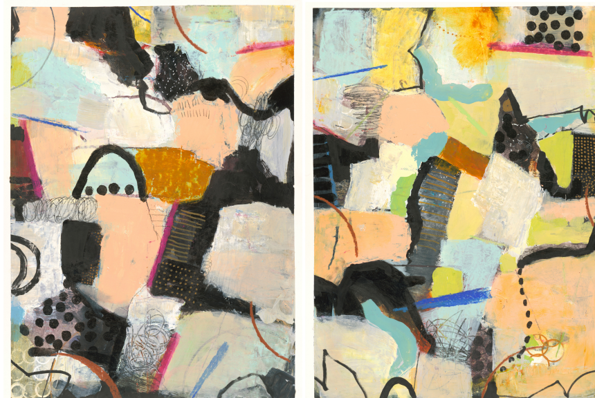
Current 1 & 2 2017 acrylic & pastel, diptych, each image/sheet 30 x 22"

All works included herein are signed, titled & dated by the artist, verso