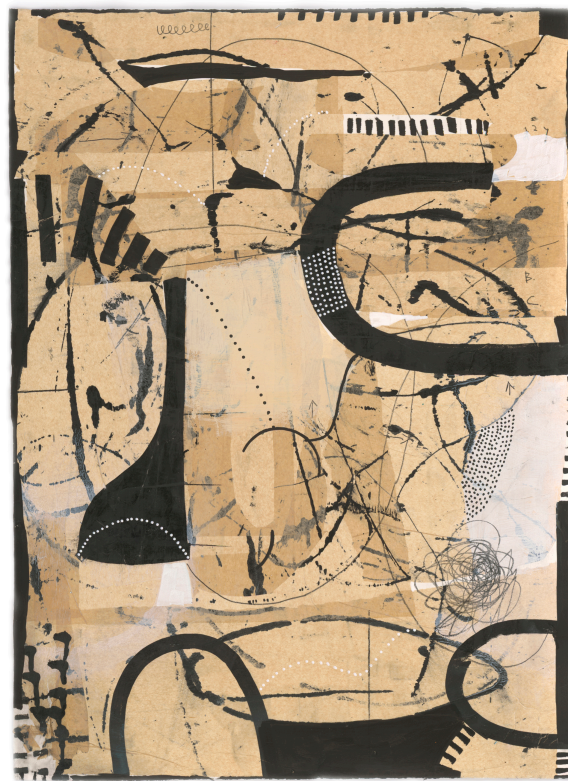
Frequency I 2019 collage with monotype & acrylic, image/sheet 30 7/8 x 22 3/8"