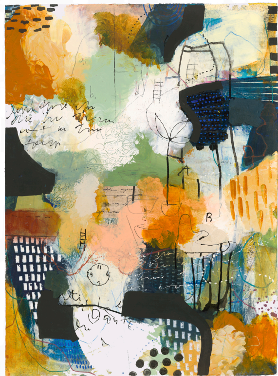
Possibility 2019 acrylic, pastel & graphite, image/sheet 31 x 22 1/2"