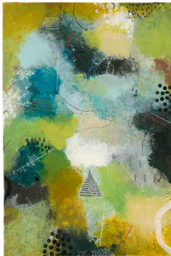
Voyager 2017 acrylic, crayon & graphite, image/sheet 44 x 30"