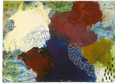
Alchemy , 1, 2, 3, & 4 2019 acrylic, each image/sheet c. 15 3/4 x 22 1/4"