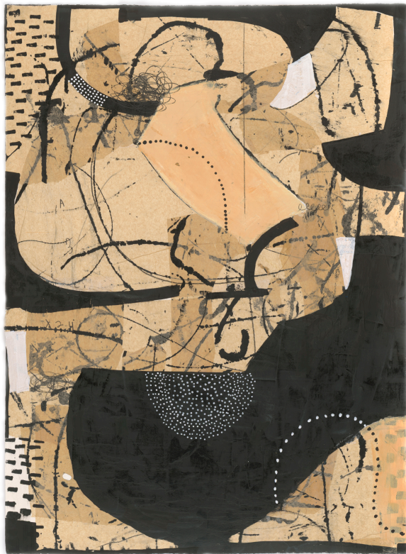
Anchored 2019 collage with monotype & acrylic, image/sheet 30 7/8 x 22 3/8"