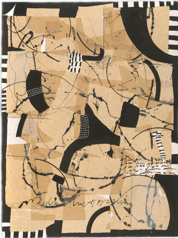
Frequency II 2019 collage with monotype & acrylic, image/sheet 30 7/8 x 22 3/8"