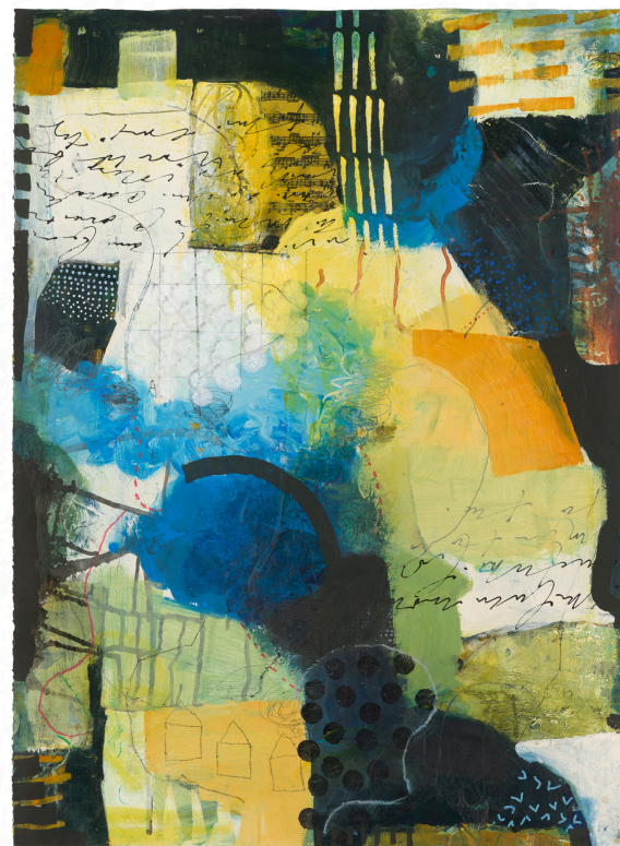
Remix 2 2019 acrylic, graphite & pastel, image/sheet 30 x 22"