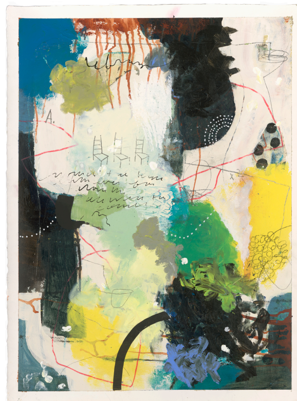
Rise & Fall 2019 acrylic, pastel & graphite, image/sheet 30 x 22 1/2"