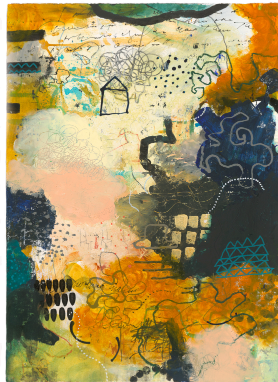
Calculate 2 2018 acrylic & graphite, image/sheet 31 x 22 1/2"