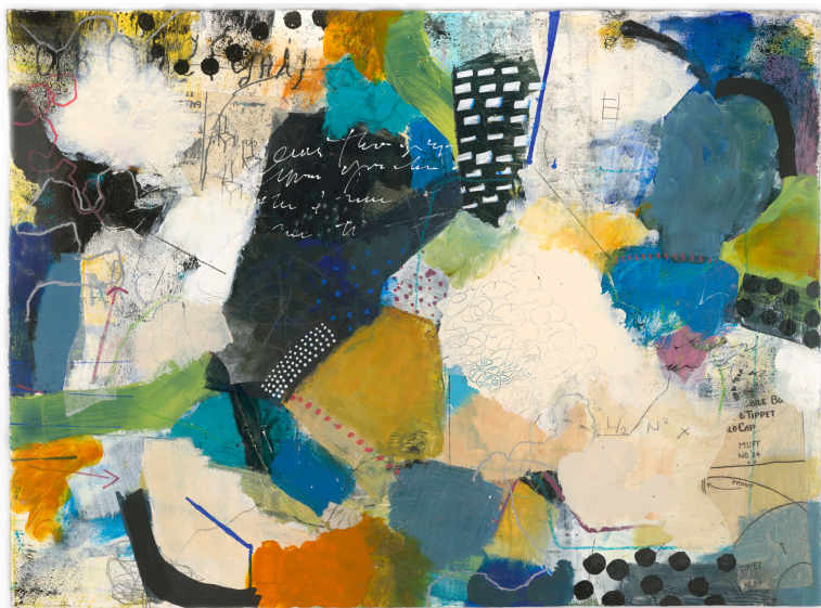
Lean In 2019 acrylic, graphite, pastel & collage, image/sheet 22 x 30"

My paintings are a mixed media exploration of layers, inner landscapes, language and archetypes. I incorporate bits of found paper, text, and symbols in abstract, painterly fields as a way to explore how we see and know the world around us.