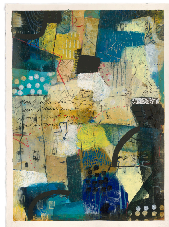
Quantum Leap 2018 acrylic, graphite, pastel & collage, image/sheet 30 x 22 1/2"