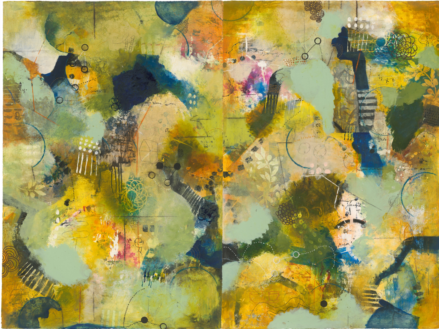
Inside/Outside 2018 acrylic, graphite, pastel, diptych, 48 x 63"