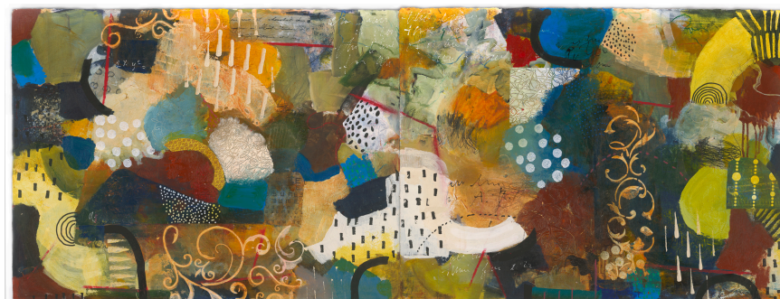
Improvisation 2019 acrylic, graphite, pastel & collage, diptych, image/sheet 22 1/2 x 60"