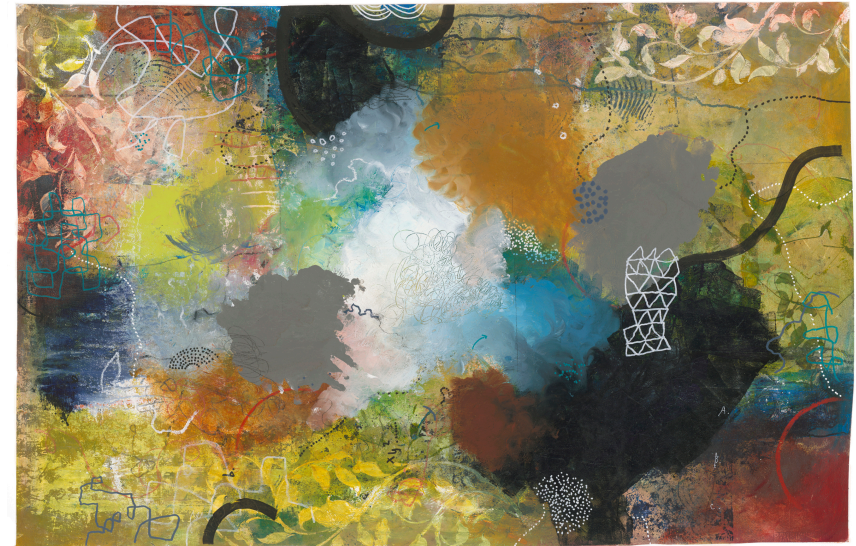
Memento I 2019 acrylic on paper, image/sheet 31 1/4 x 48"