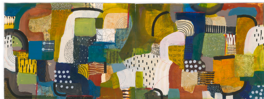
Correlation 2019 acrylic, graphite, pastel & collage, diptych, image/sheet 22 1/2 x 62"