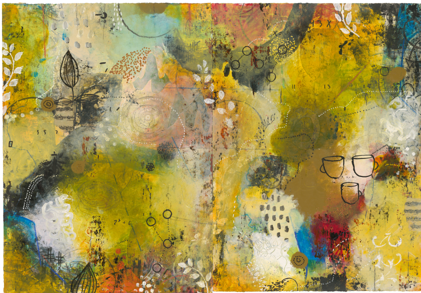
Frequency 2018 acrylic, pastel & collage; diptych 31 x 45"