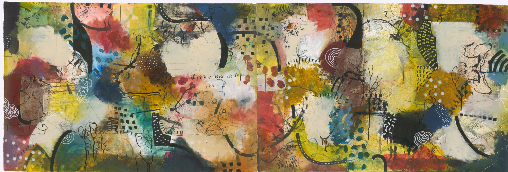
Intersection 2019 acrylic, pastel & graphite, diptych image/sheet 31 3/4 x 96"